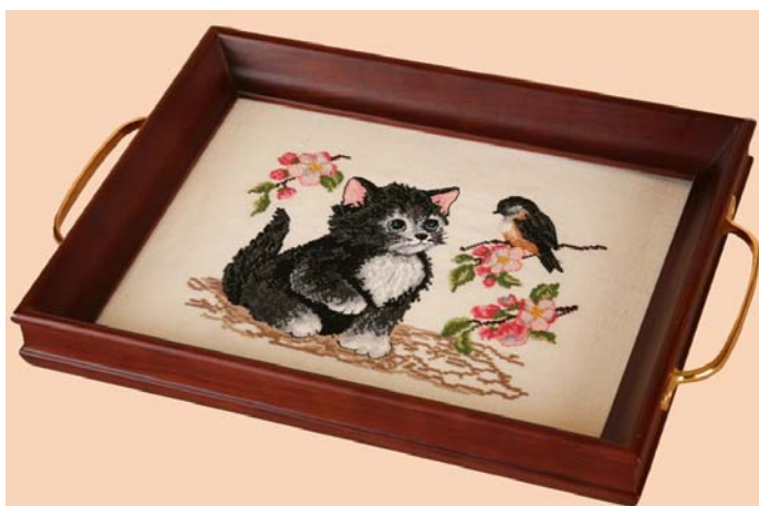
Illustrated above: Sudberry Medium Tea Tray #80061 with design #8601