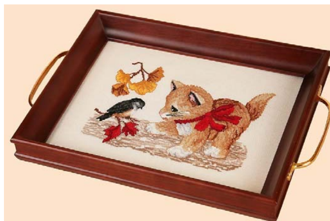
Illustrated above: Sudberry Medium Tea Tray #80061 with design #8603