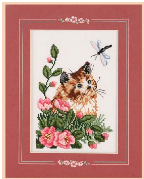
Illustrated above: Framed with design #8646