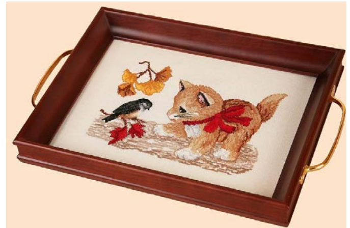
Illustrated above: Sudberry Medium Tea Tray #80061 with design #8603