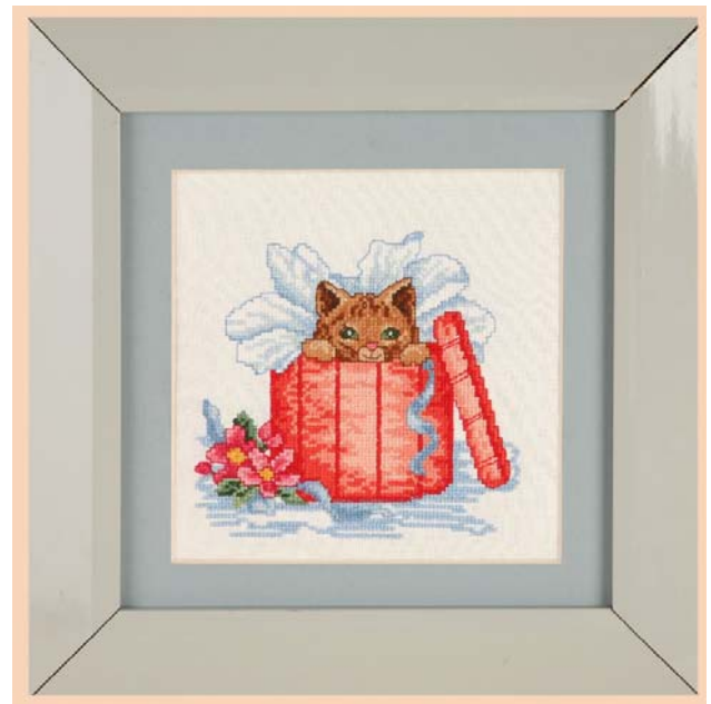
Illustrated above: Framed with design #8625