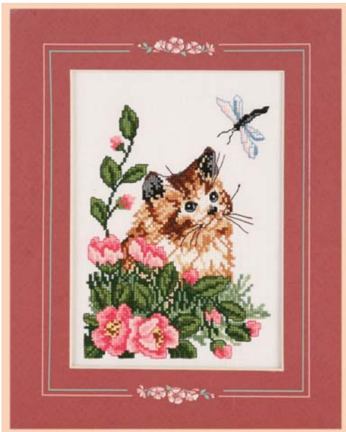
Illustrated above: Framed with design #8646