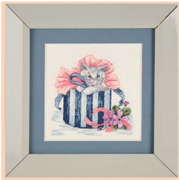
Illustrated above: Framed with design #8622