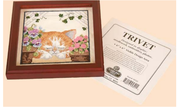
Illustrated above: Sudberry Trivet #95321 with design #8651