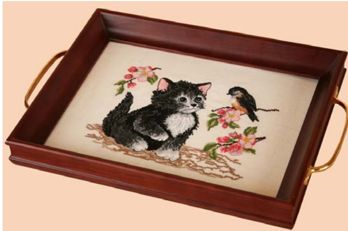
Illustrated above: Sudberry Medium Tea Tray #80061 with design #8601