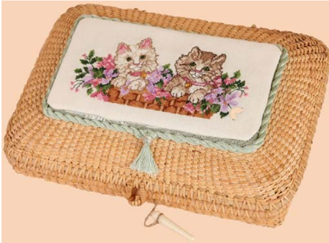
Illustrated above: Sudberry Nantucket Letter Box #30060 with design #8619