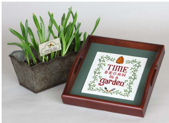
Illustrated to right: Sudberry Small Square Tray #68001 with design #10298